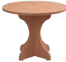
B. Round Versa conference table shown with optional knee relief base