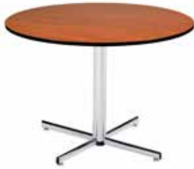
A. Round Europa pedestal table with X base.