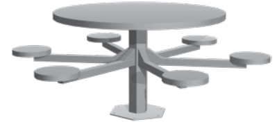
D. Six person metal outdoor pedestal table.