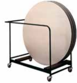
C. Round folding table caddy for vertical storage.