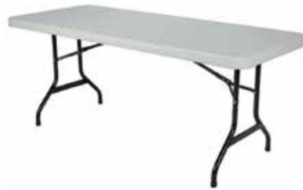
B. Rectangular Ultra-Lite folding table.