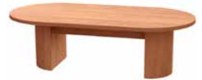
C. Oval Versa conference table with premium top & half cylinder base.