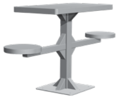
A. Two person metal outdoor pedestal table.