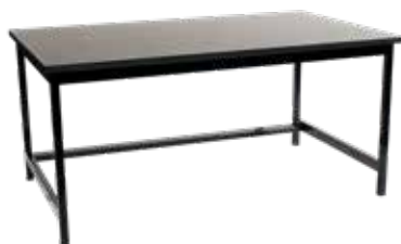
C. Rectangular Science Activity table with metal "C" leg base.