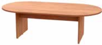
A. Oval Versa conference table with standard top & base.