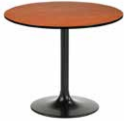
A. Athens Fixed Height Table, Round