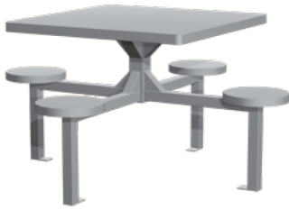
E. Four person outdoor spider base table.