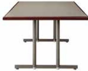
B. Square Europa pedestal table with TT base.