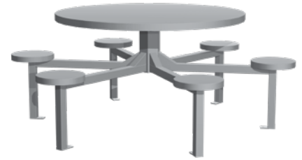
G. Six person outdoor spider base table.