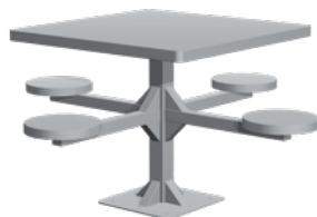
B. Four person metal outdoor pedestal table.