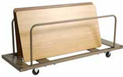
A. Rectangular folding table caddy for vertical storage.