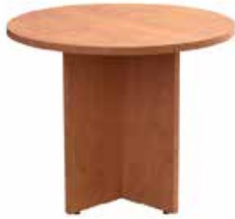
A. Round Versa conference table with cross base.