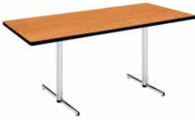
C. Rectangular Europa pedestal table with T base.