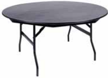
A. Round Dura-Lite folding table.