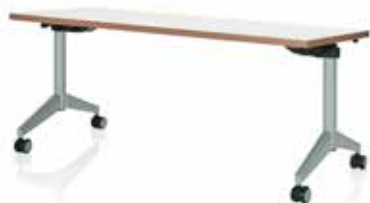
A. Rectangular flip top table with metal nesting leg base.