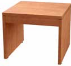
A. Square Versa side table.