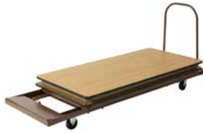
B. Rectangular folding table caddy for horizontal storage.