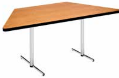
D. Trapezoidal Europa pedestal table with T base.