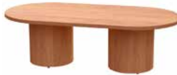
B. Oval Versa conference table with premium top & cylinder base.