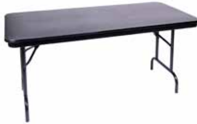
B. Rectangular Dura-Lite folding table.