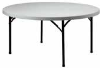
A. Round Ultra-Lite folding table.