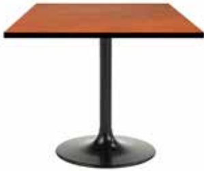
A. Athens Fixed Height Table, Square