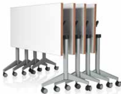
Rectangular tables shown nesting.