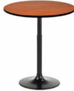
B. Athens Adjustable Height Table, Round