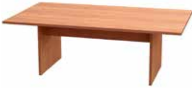
A. Rectangle Versa conference table with standard base.