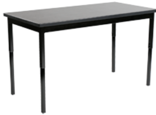
B. Rectangular Science Activity table with adjustable four leg base