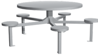
F. Five person outdoor spider base table.