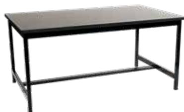
D. Rectangular Science Activity table with metal "H" leg base.