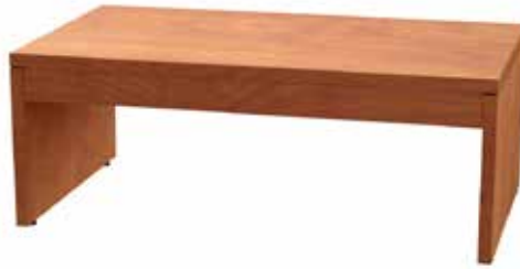
B. Rectangular Versa coffee table.