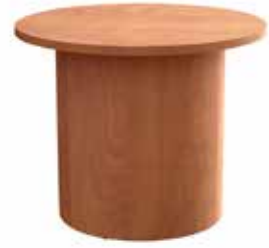
C. Round Versa conference table with cylinder base.