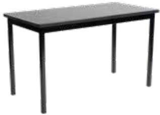
A. Rectangular Science Activity table with four leg base.