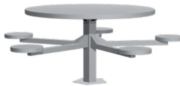
C. Five person metal outdoor pedestal table.