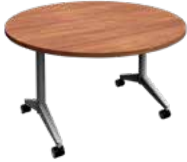
A. Round flip top table with metal nesting leg base.