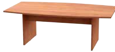
B. Boat shape Versa conference table with standard base.