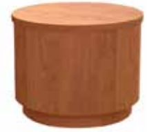
C. Round Versa drum table shown with toe kick.