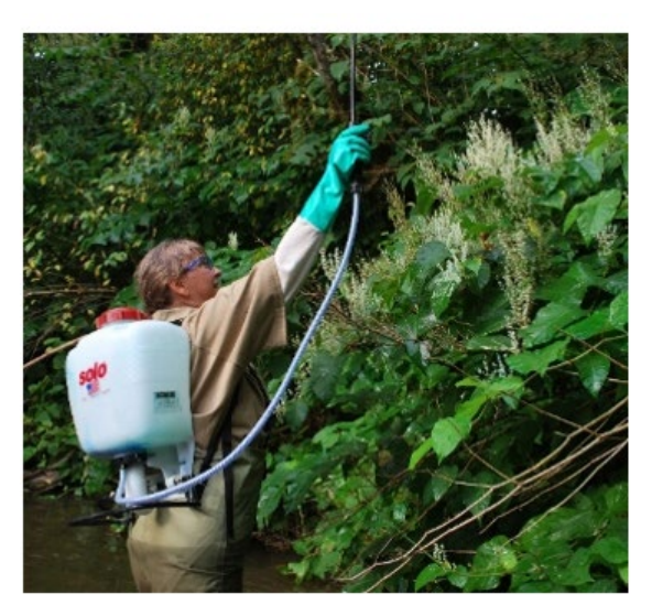
Depending on their custody level, incarcerated individual jobs can be inside the facility or out in the community supervised by correctional staff.

DOC is committed to maintaining and expanding work and training programs that give inmates job skills they can use after prison. DOC also wants to inspire a positive work ethic among inmate workers. As an added benefit, inmate workers make products that are used in schools and other government buildings. They provide services to communities through work crews which helps reduce the tax burden of residents in the state. Work assignments are available based upon the custody level and location of each inmate. There may be other restrictions for some which will be explained to them by their Classification Counselor.