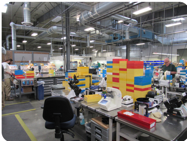
Incarcerated workers processing orders in the optical lab.