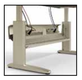
Wire Trough/Data Management - house the modular electrical system and discretely provide receptacles for the user.