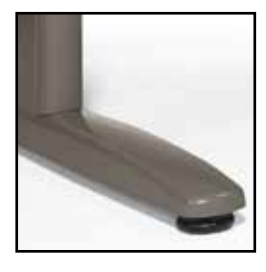
Glides - adjust up to 1" to provide secure support on uneven floors.