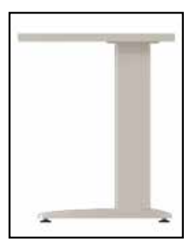
Fixed Height Desk

Fixed height and adjustable tables can also be combined in a single workstation to create a sit-stand environment that will allow you to comfortably accomplish tasks from both a standing and seated position.