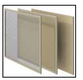
Privacy Screens - are available in transparent plastic to admit natural light or tackable fabric for acoustic dampening.