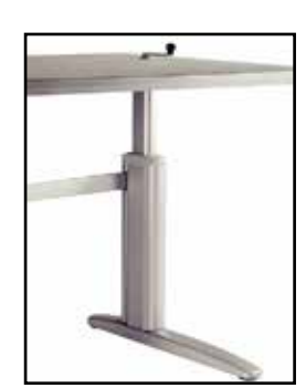
Crank Height Adjustable