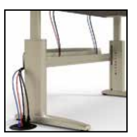
Power and Data - cable trays attach to cross-braces and route wires beneath the desk, clear of screens and modesty panels.