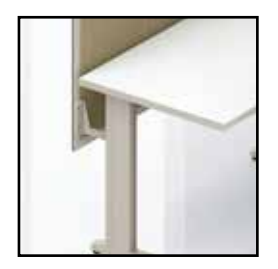
Modesty Panels - are created by screens which extend both above and below the worksurface to provide privacy for the user.