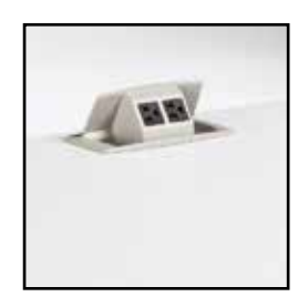
PowerUp ® - units provide 2 electrical receptacles along with 2 data/communication jack locations on the worksurface.