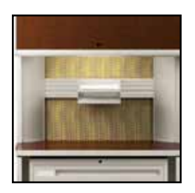
Mounted Overheads are mechanically fastened to the desk frame, providing secure lockable storage.