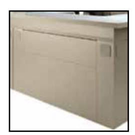
Full Modesty Panels - provide unbroken coverage for the front of a transaction counter.