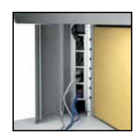
Stanchion Mounted Receptacles - can be used to make electrical and datacomm connections.