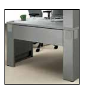
Partial Modesty Panel - reinforces the professional yet approachable aesthetic of a peninsula desk.