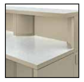
Stanchion Mounted Countertops - create transaction spaces while concealing 11½" of storage space.

Volition not only exceeds ANSI/BIFMA standards, it couples convenience items to its safety features. A 10-wire electrical distribution system can be housed within the desk's horizontal structural beam to supply power at the worksurface without overtaxing building circuits or running dangerous extension cords.