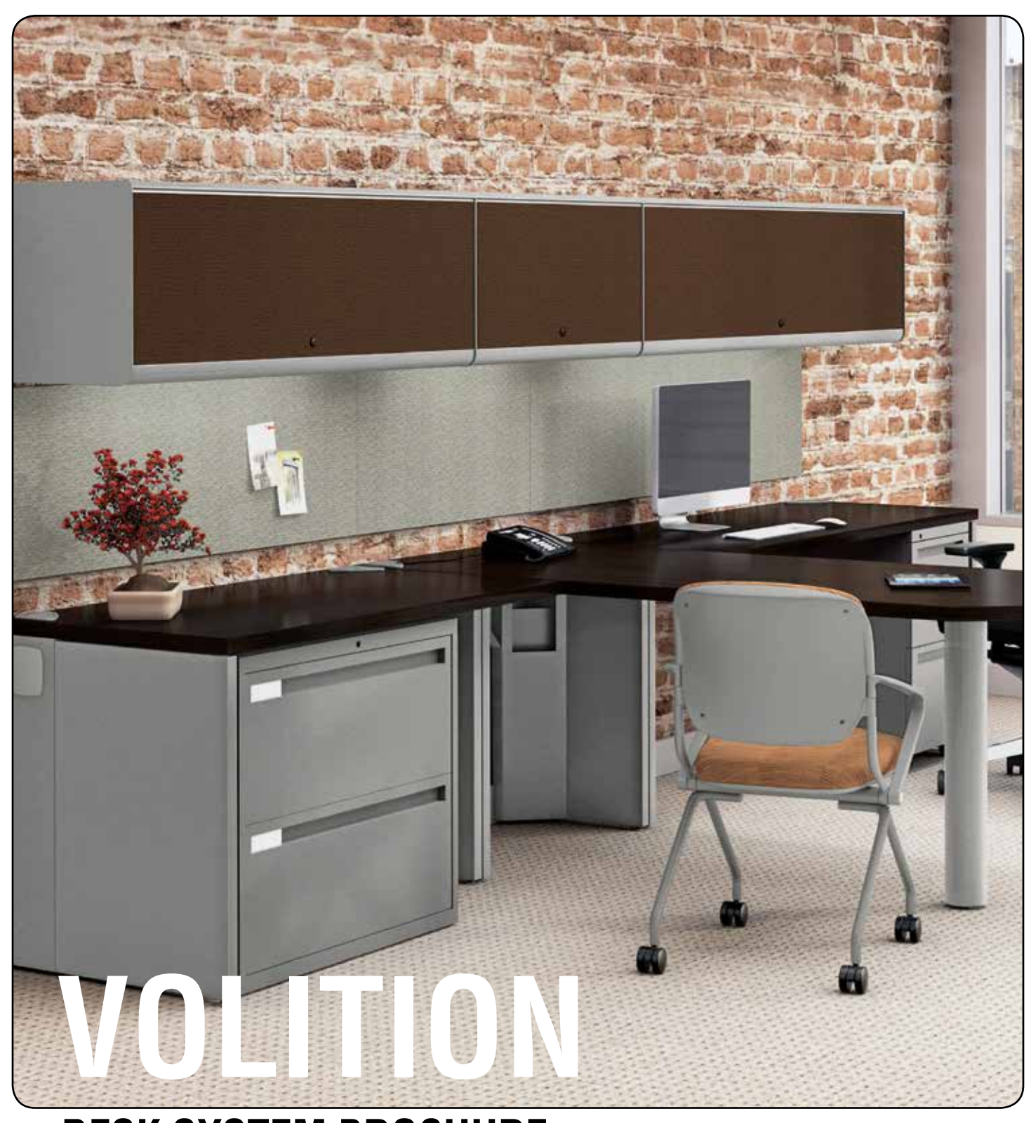
DESK SYSTEM BROCHURE