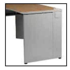
Full End Panel - enhances privacy, reduces noise, and encloses storage cabinets beneath the desk.