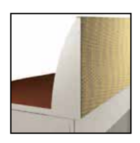
Worksurface Mounted Screens - provide privacy independent of stanchions and overheads.