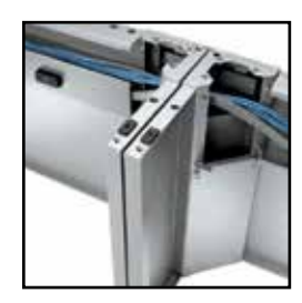
Rigid Wireway - Flexible desk jumpers connect the power systems of adjoining desks, reducing the number of feeds required.

Every component of Volition was thoughtfully designed to be both aesthetically pleasing and highly functional. Although stanchions primarily support overheads or countertops, as part of the Volition line they are also tailored frames for privacy screens. The screens themselves are a combination tackboard, acoustic dampener, and divider, but they also create a finished look when bridging the gap between an overhead and desk.