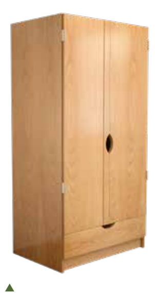
Full wardrobe with one drawer.