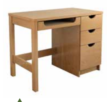
Pedestal desk (box/box/file) shown with optional keyboard tray.