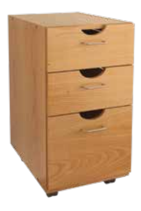
Barrier-free mobile pedestal with two box drawers and one file drawer.