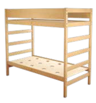
Standard beds shown bunked. Bed decks and safety rails sold separately.