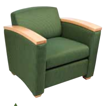
Lounge chair with exposed wood armcaps.