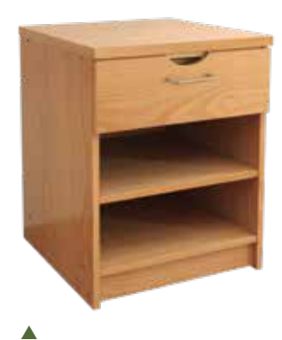
One drawer barrier-free dresser with adjustable shelf.