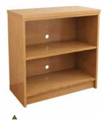
Two shelf bookcase.