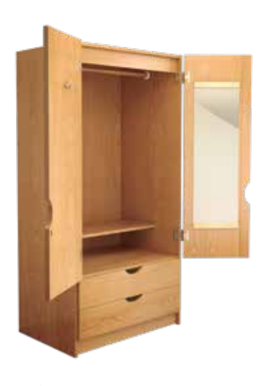
Full wardrobe with two drawers shown with optional mirror.