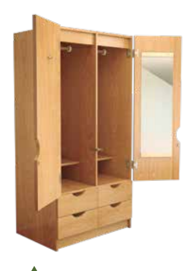
Split wardrobe with four drawers shown with optional mirror.