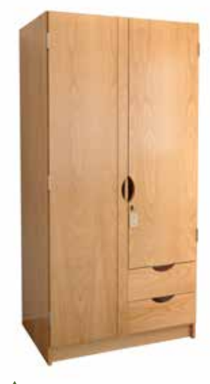
Split wardrobe with two stack drawers shown with optional hasp for locking.