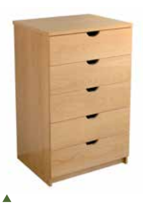
Five drawer dresser.