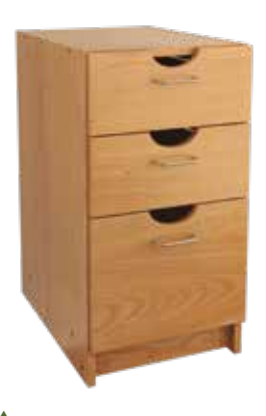
Barrier-free pedestal with two box drawers and one file drawer.