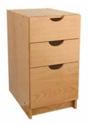
Pedestal with two box drawers and one file drawer.