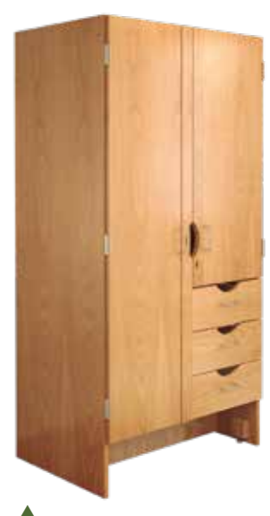
Barrier-free wardrobe with three stack drawers shown with optional hasp for locking.