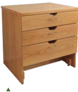
Three drawer barrier-free dresser.