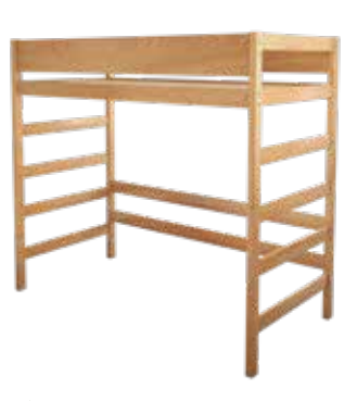
Standard bed shown lofted. Bed deck and safety rails sold separately.

Note: Bunks are NOT certified for use by those under 12 years of age.