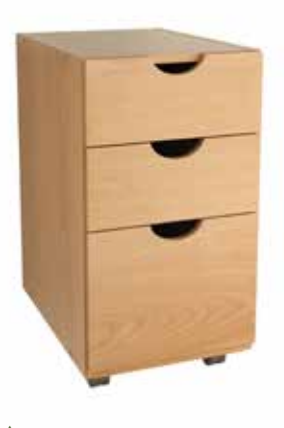
Mobile pedestal with two box drawers and one file drawer.