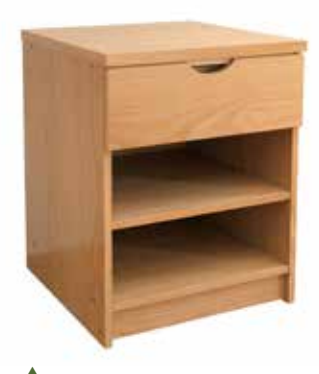
One drawer nightstand with adjustable shelf.