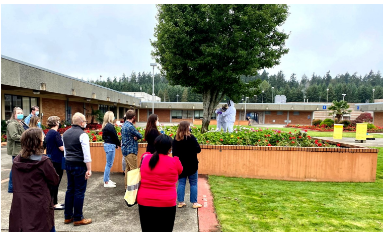
A chance meeting with incarcerated women/beekeepers at WCCW was a fitting closure to the 2022 Legislative Tour. Bee happy!