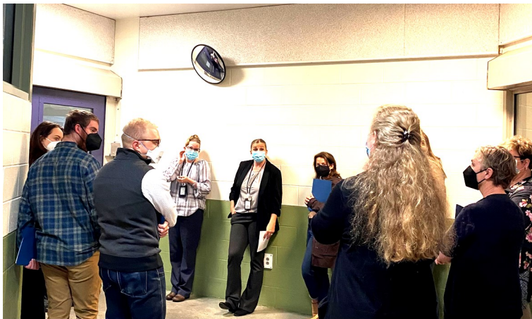
The legislative tour of WCCW included an important discussion about reducing the use of restrictive housing and staff safety.

You can take the survey by clicking here .